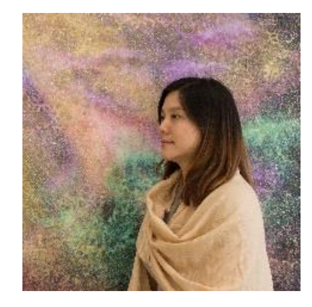
Founder of Ting Art Studio 創辦人 Committee of Young Artist Development Foundation YADF 藝育菁英委員

She has had solo shows in London, America, Shanghai, Hong Kong, UK and Taiwan and her work has been exhibited in numerous selected group shows and art fairs all over the world; including Art Stage Singapore, 33Auction Singapore, Contemporary Art Auction at the Centre for Chinese Contemporary Art (CFCCA) in Manchester, Asian Art in London and ScopeBasel Art Fair in Switzerland. Her recent Chinese contemporary ink work "Golden Beam" & "Stream of Praise" from the Ray of Light series were selected and successfully auctioned off at the Rayenel Spring Auction 2018 & 2019 in Taiwan.